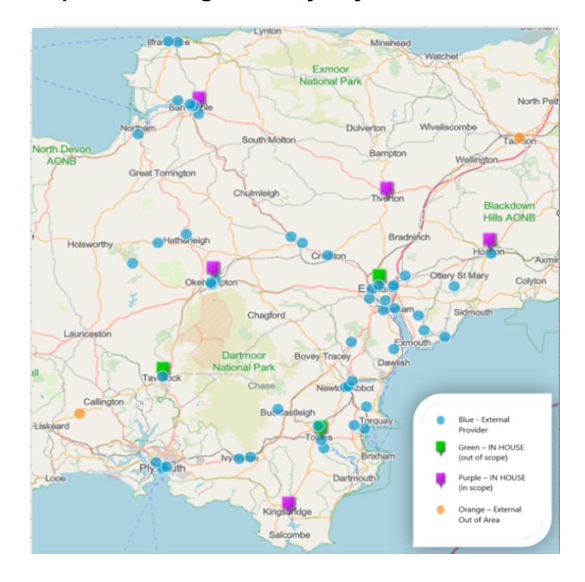
Map 1 – Learning Disability Day Services

Map 1 shows locations of all 53 commissioned learning disability independent sector day services and in-house learning disability day services in Devon and surrounding areas. This includes the services within an approximate 30-minute drive as displayed in the table as well as those further away. (Please note some of the blue circles represent more than 1 day service)